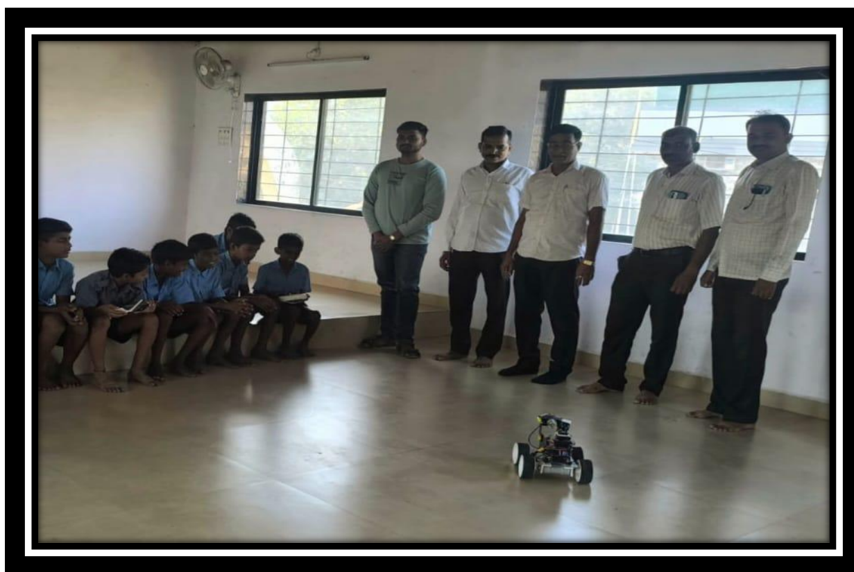
Students operating the Robot.