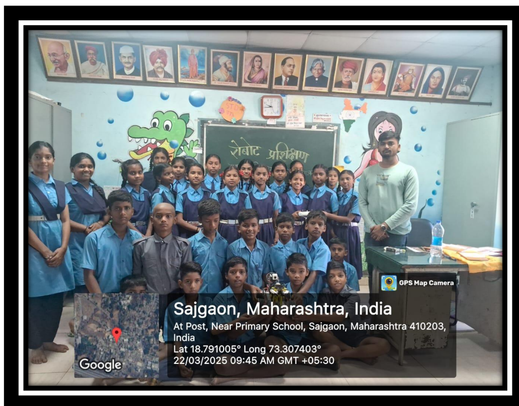
Group photo with students.