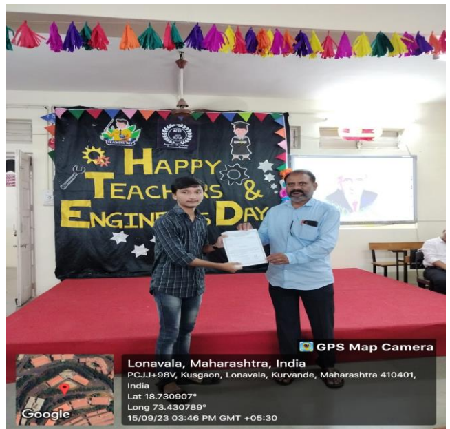
Appreciation of Students Topper by the faculty