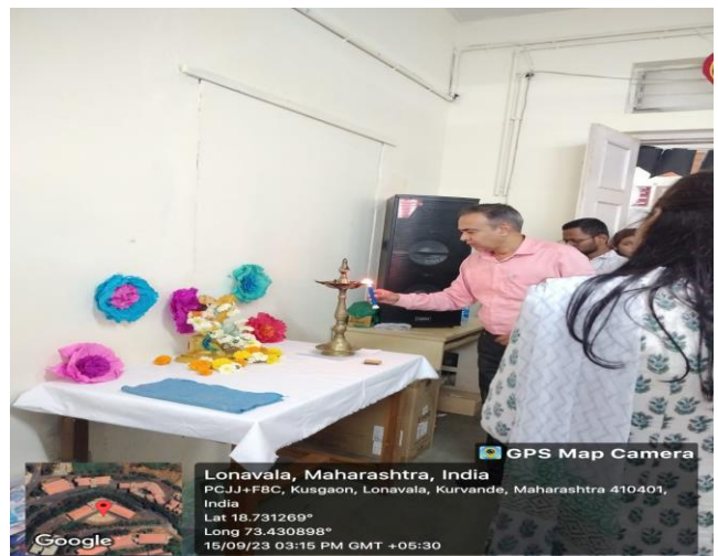
Lamp Lighting by Faculty

Dept Tel.:+91 2114-673490,673427 , Office :673355 ,673356, Telefax: 02114-278304 email:hodce.sit@sinhgad.edu