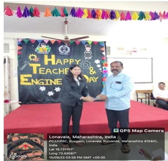
Token of Love by The Students