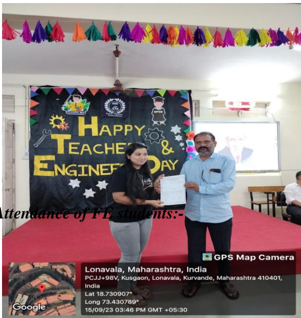
Attendance of FE students:-