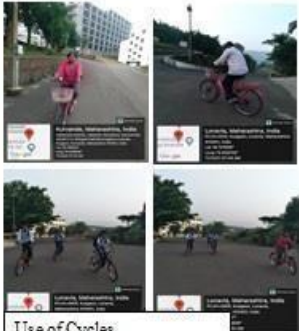
Use of Cycles