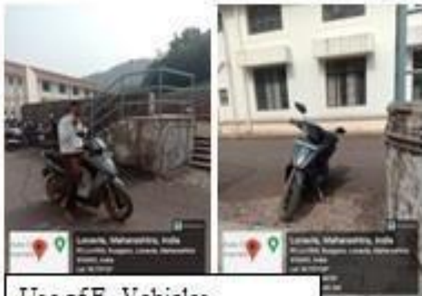
Use of E- Vehicles