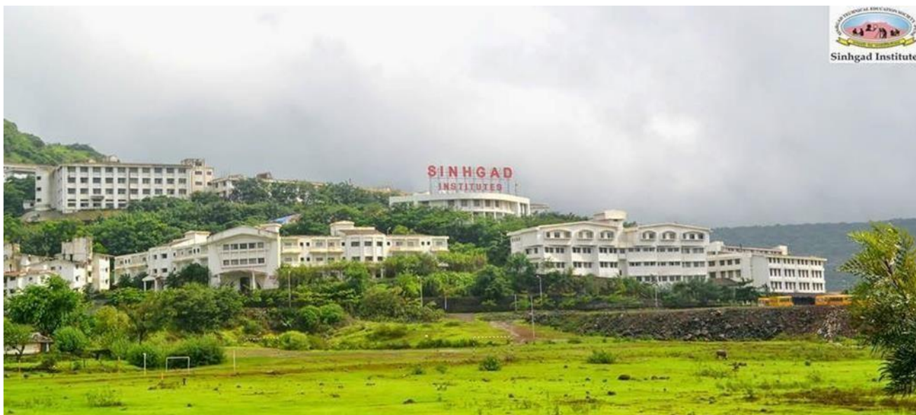
Sinhgad Institute Lush Green Campus

We have dedicated gardening team of campus to look after these activities of plantation and further nurturing of plants. At the end of every year, CO2 absorption capacity is analyzed.