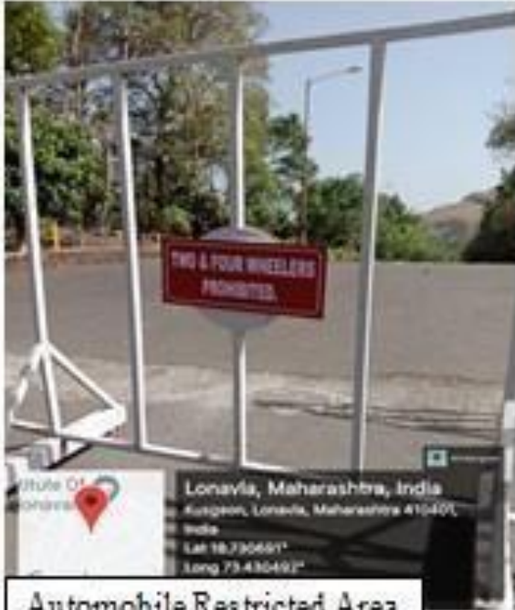
Automobile Restricted Area