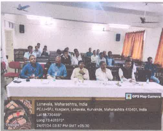
Dignitaries on Dias