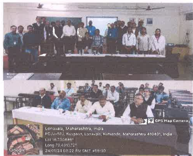
Members of IQAC Team