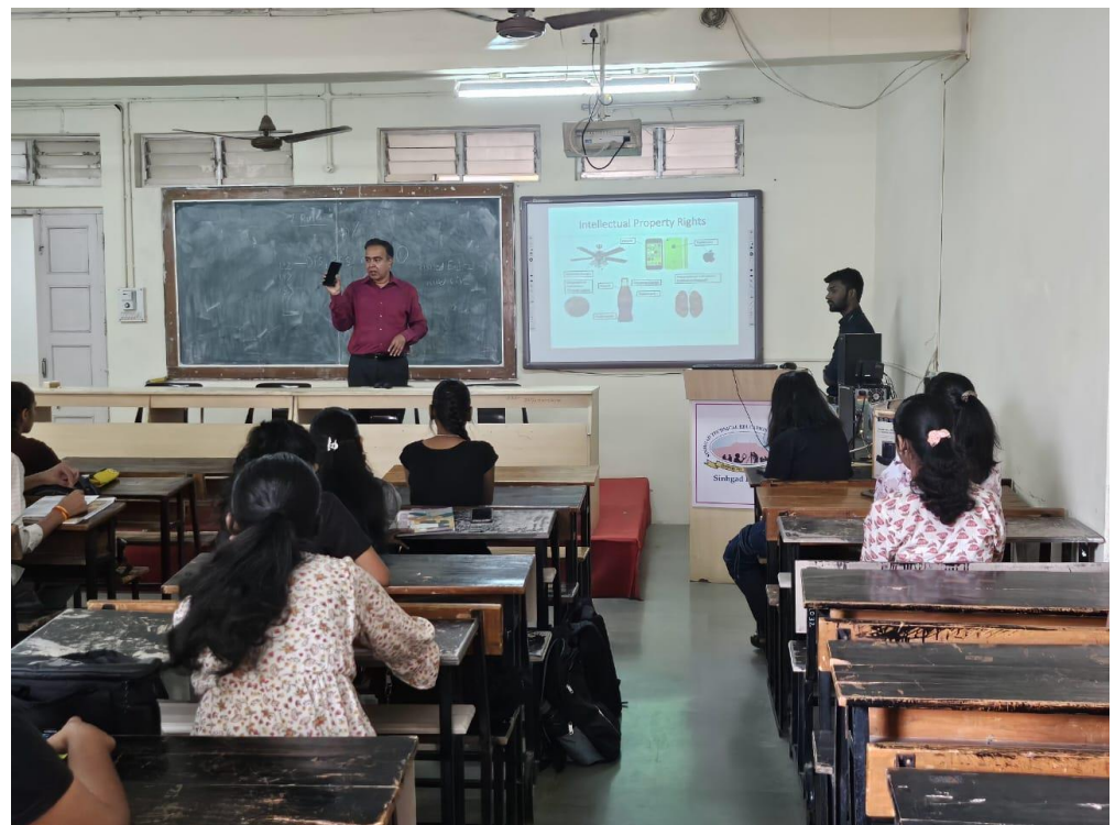
Providing few Real Life Examples