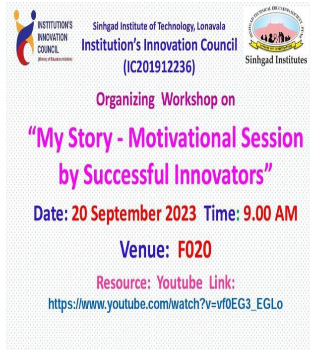
Brochure of the Seminar