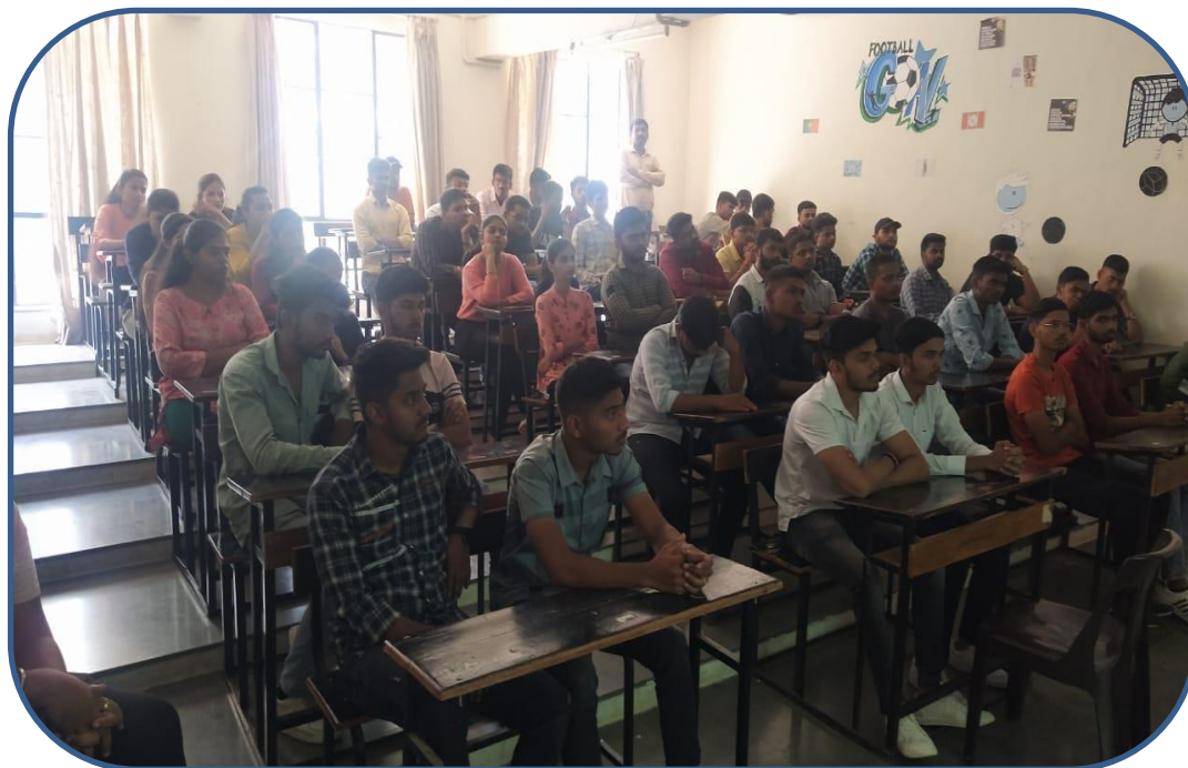
Participants for Workshop