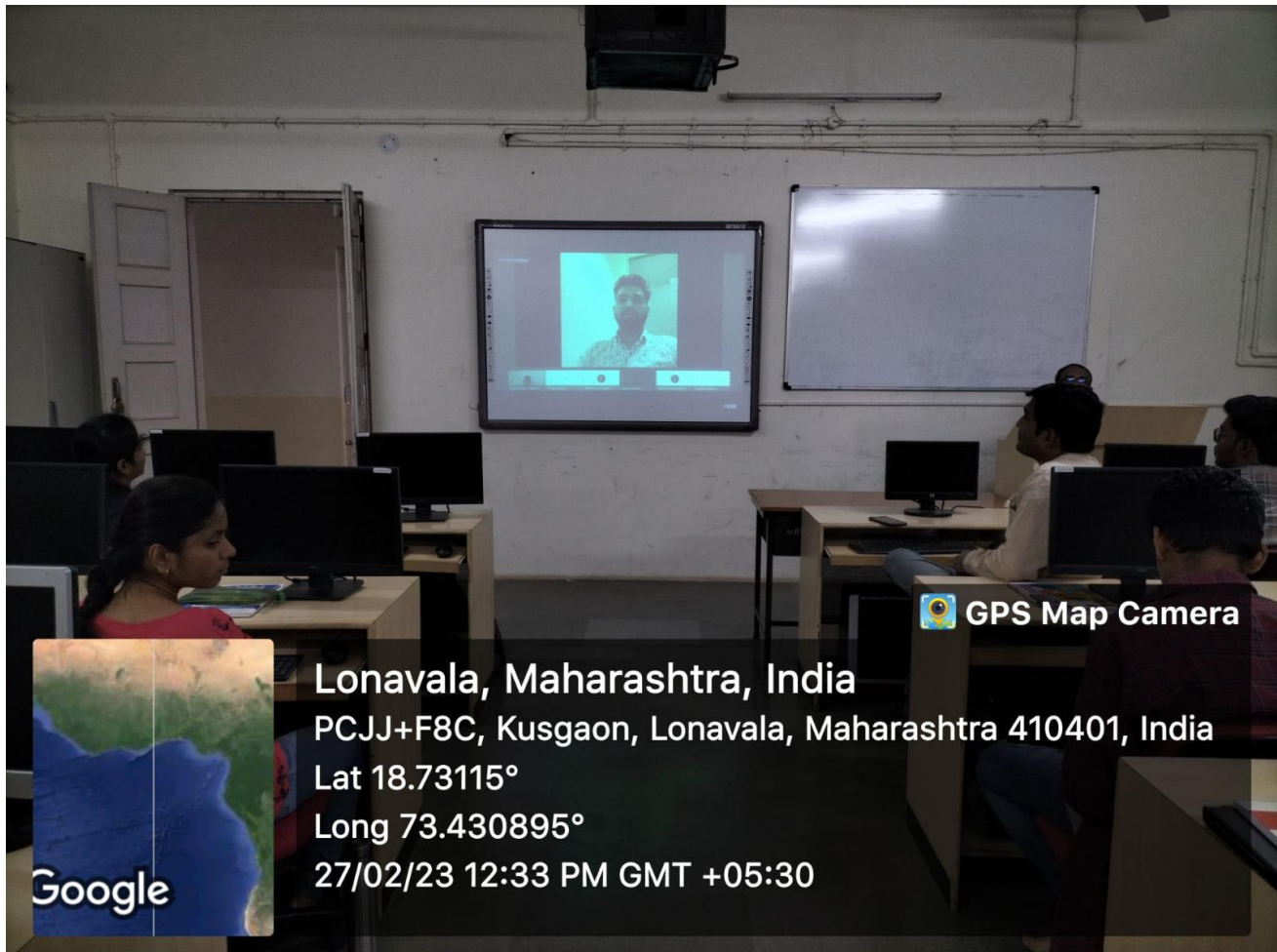
Online event on Design Thinking, Critical Thinking and Innovation Design