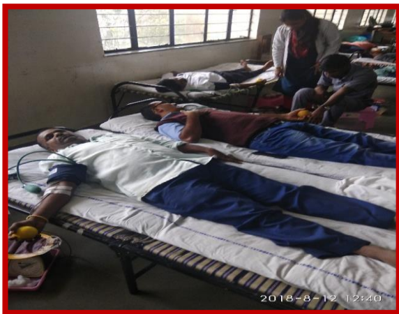
Blood donation by student and staff