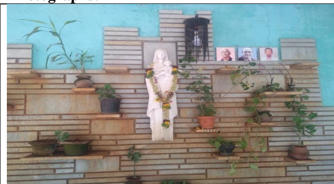
Snehasadan Orphanage, Khandala