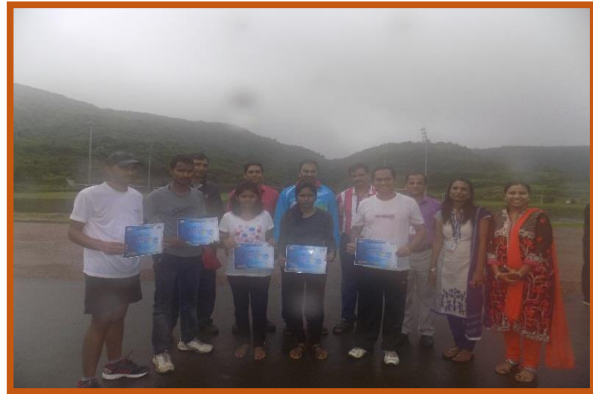
Winners of Marathon