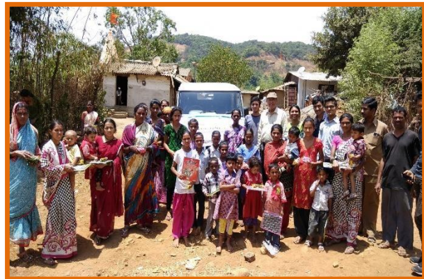
Visit to school