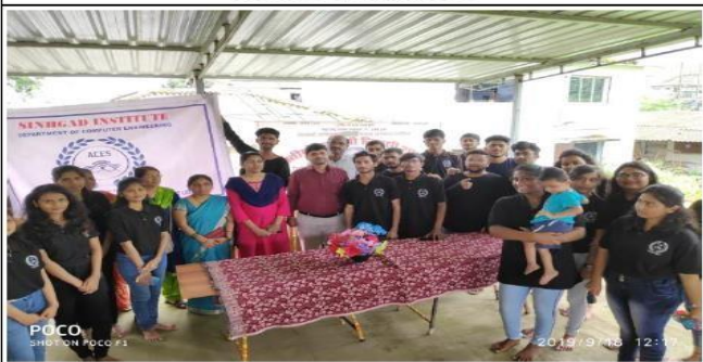
A warm welcome to the NGO in Karjat