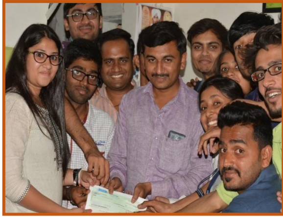
Funding amount handover.