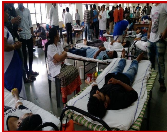
Blood donation by student and staff