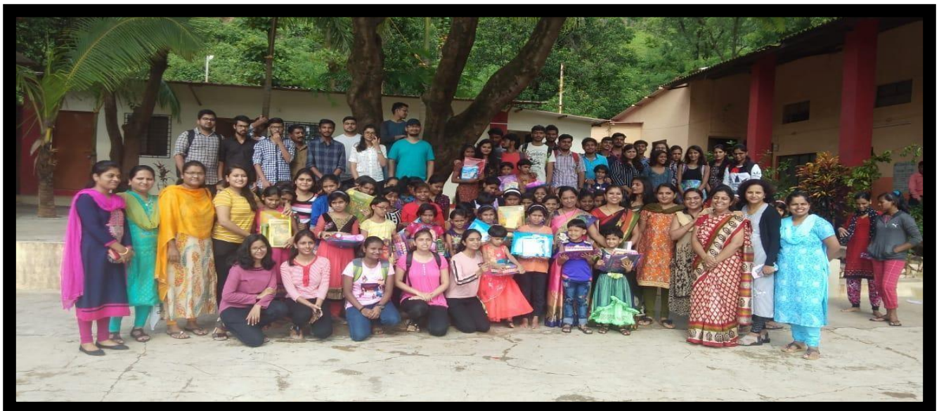
Stationary and goods given to childrens.