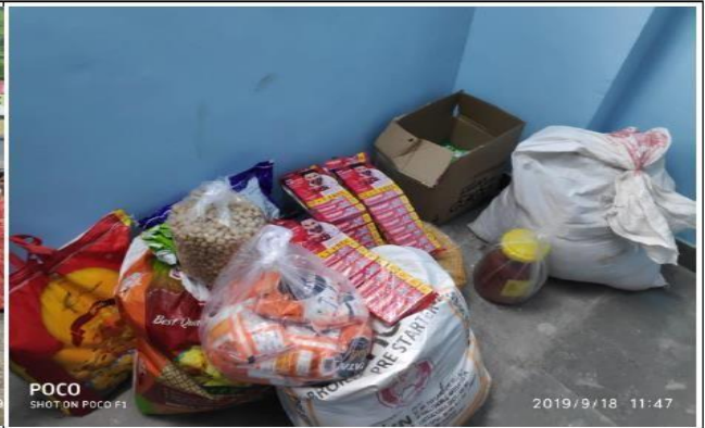
Food Products brought for the Children