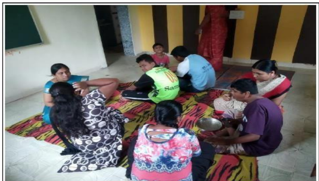
Children at the NGO