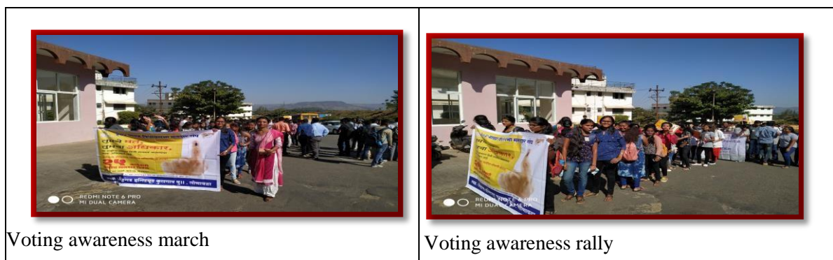
Voting awareness march