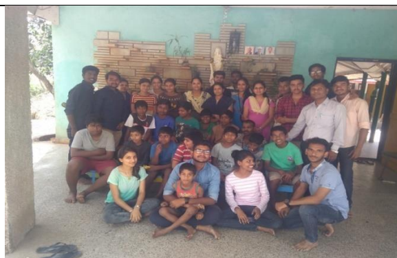
Staff Coordinators with Children, Care taker and student volunteers