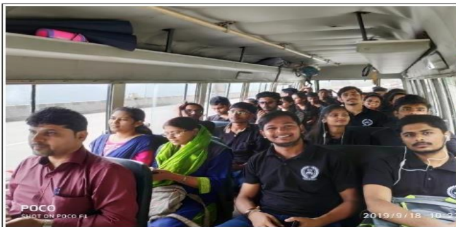
Committee Members on the way to Karjat