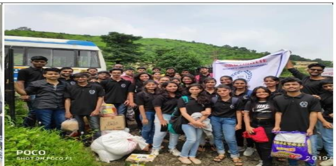
ACES Committee at the NGO Location