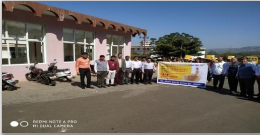
Rally By students