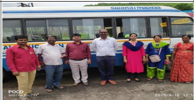
Our Teaching Staff with the NGO staff