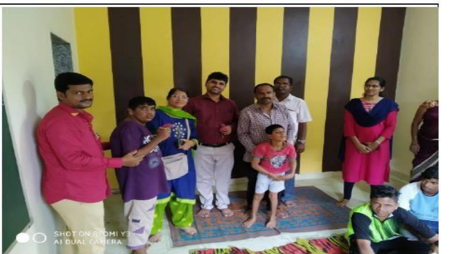
Our teaching staff interacting with the children