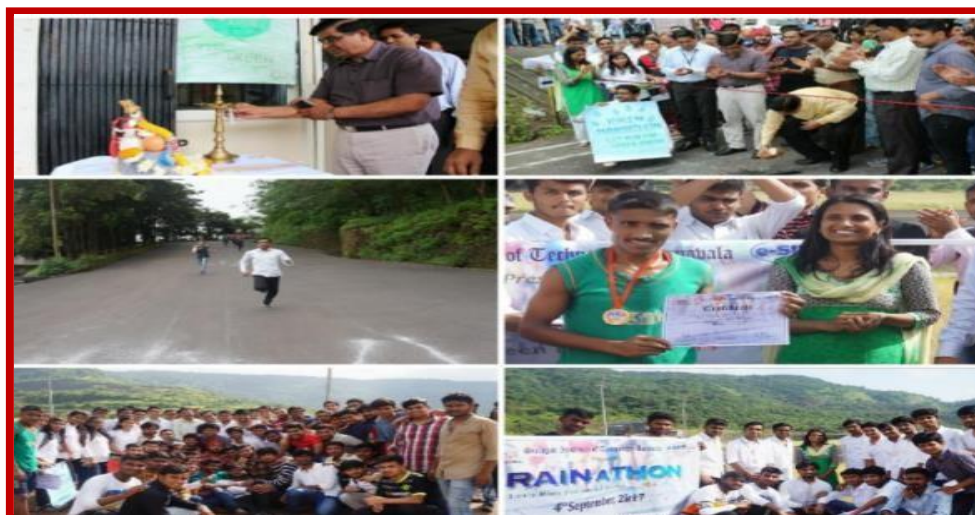
Ribbon cutting by Principal & Winners

The main motive of event was to celebrate Teachers day, engineer’s day and Parangat. Almost 30 students and all faculty members attended this event. We also appreciated Toppers and Teachers of E&TC department who achieved great success in previous academic year. We also appreciated students for their co-curricular activities in past year. At the end event was inspirational and informative and was the great success.