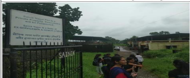
NGO Office in Karjat