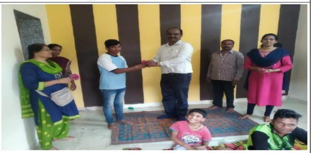
Warm Greeting from the children to the teaching staff