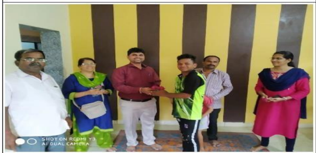
Warm Greeting from the children to the teaching staff