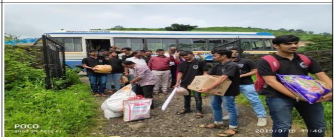
Committee Members carrying the food products to the NGO.

our members in coordinating the whole campaign. After collecting all the funds, we decided to provide them with food products (Ration) which will surely be sufficient for all the people for more than a month. We visited the NGO at Manchar, Karjat, Maharashtra on 18th September 2019 with all the help. We were welcomed warmly by the NGO staff as they were very happy to have us there.