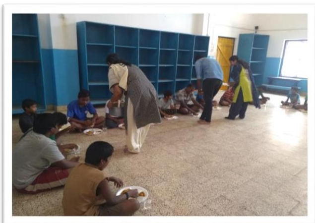
Staff Coordinators while serving foods to children