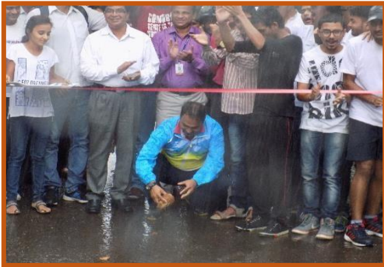
Ribbon cutting by Principal