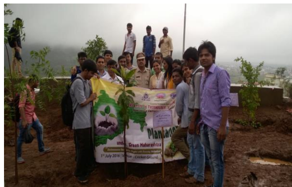
Tree Plantation by Staff and Students