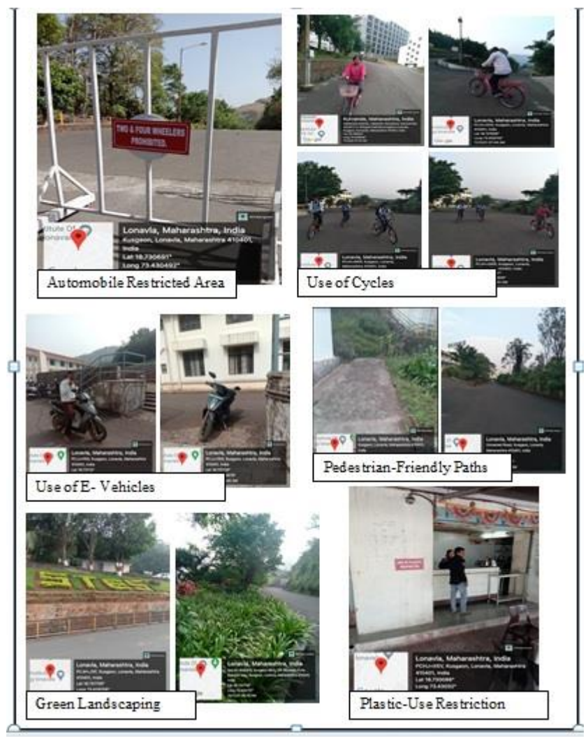
Efforts to reduce carbon foot prints

The SIT campus covers total 200 acres area which is having the green cover of 75000 mature woody trees which capture 138.78 tons of CO<sub>2</sub> per year.