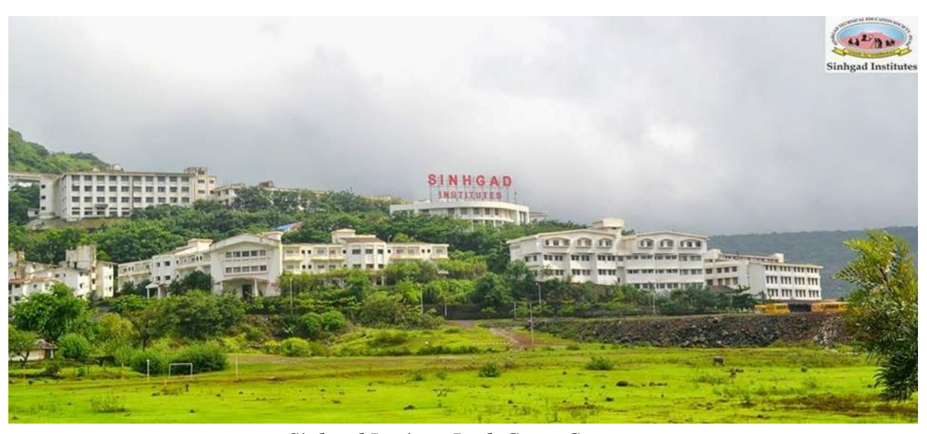
Sinhgad Institute Lush Grren Campus

We have dedicated gardening team of campus to look after these activities of plantation and further nurturing of plants. At the end of every year, CO2 absorption capacity is analyzed.