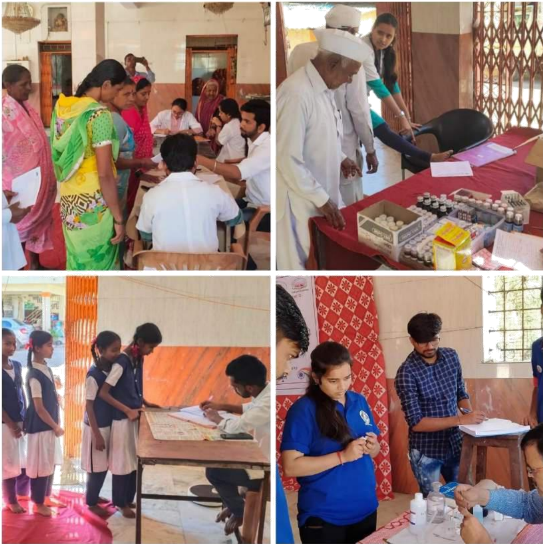
Health Check-up Camp

As per the planning done on 27 th December, health camp was arranged in village for the villagers. After breakfast, all volunteers and staff members gathered at the place where health checkup camp has to conduct. Medical team was arrived at 9:00 am then after some arrangement, health checkup cam had started at 9:45 am to 12:00 am. People gave good response to the camp. After camp all members went for lunch.