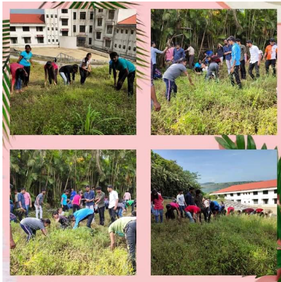
Volunteers cleaning campus

As part of the Swachh Bharat mission programme NSS volunteers cleaned road sides, bus stops, open ground, parking area near our college premises on the occasion of “Swachata Pandharvda”. College students along with our NSS volunteers participated in this cleanliness programme also made awareness about cleanliness in the campus and nearby.