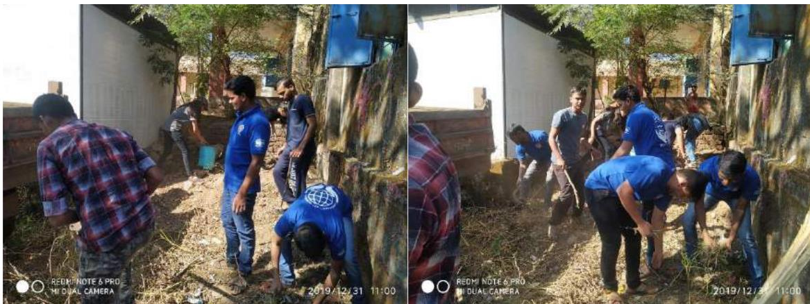
Cleaning the School Surrounding