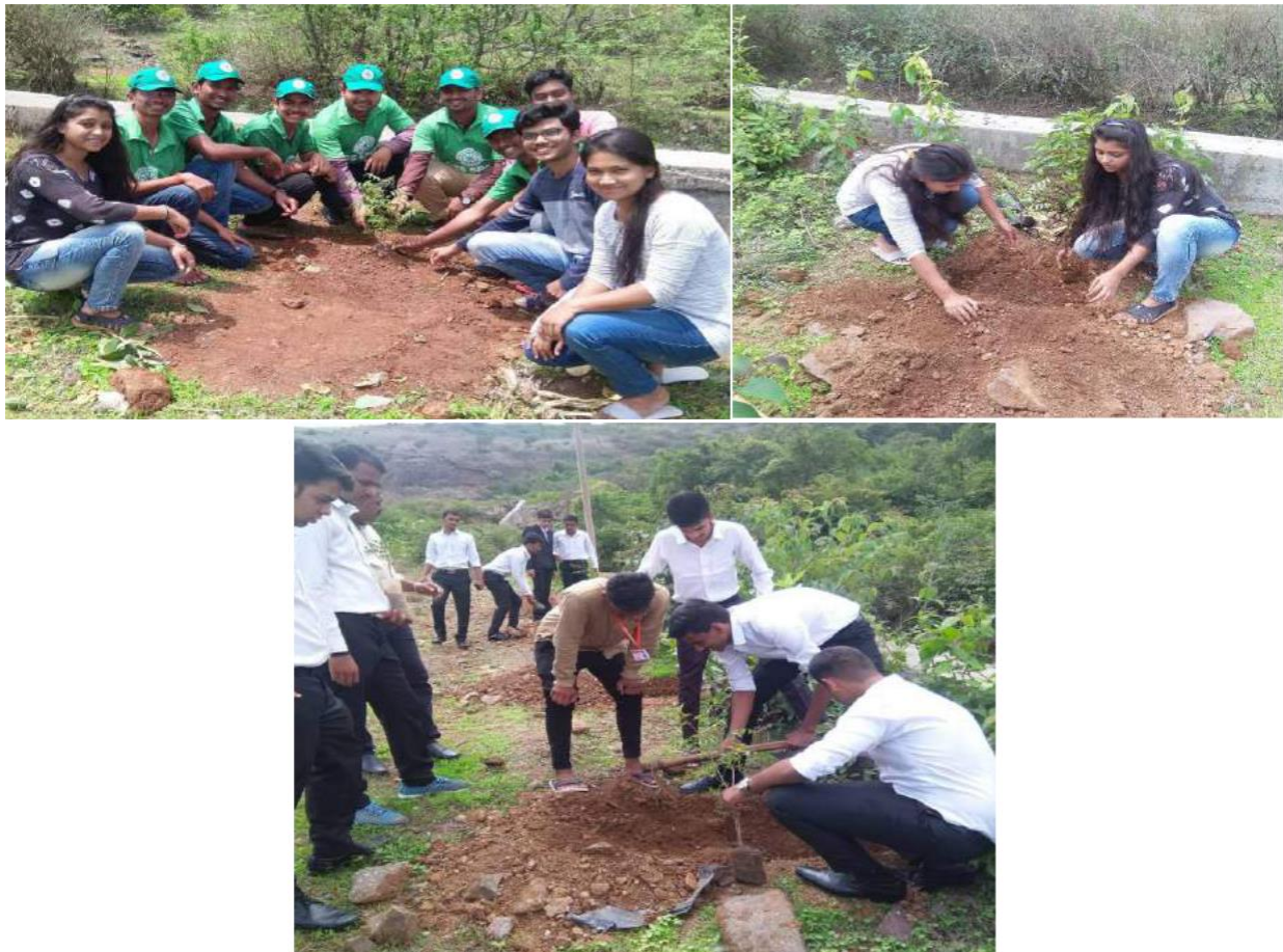
Volunteers and Staff planting trees

Plantation of trees is important as they improve the life and fulfill essential needs of mankind. The Volunteers of National Service Scheme, Sinhgad Institute of Technology enthusiastically participated in “ Tree Plantation ” program which was arranged in college campus. Different types of saplings were planted by the volunteers.