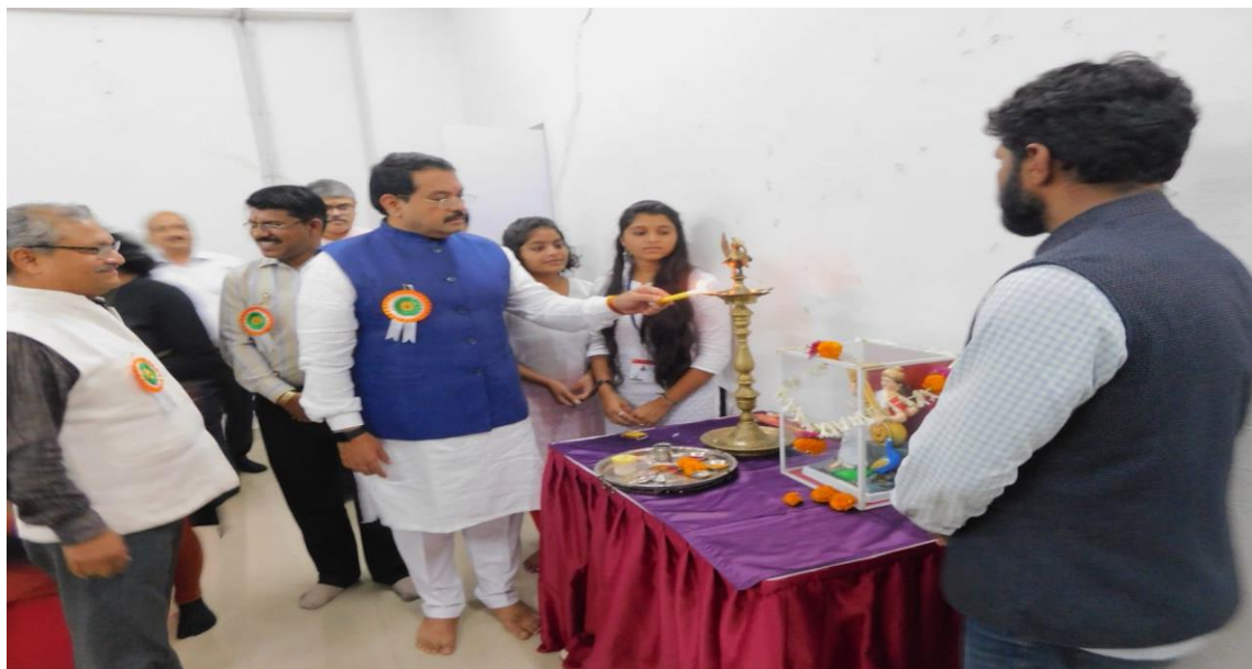
Saraswati Poojan by Guest