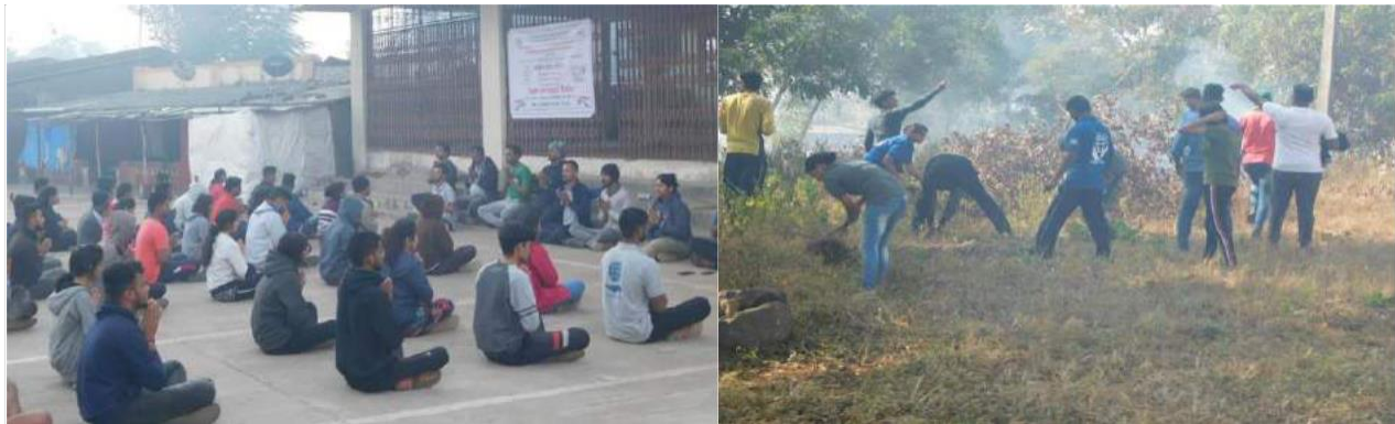
Morning Prayer and Cleanliness Drive

On the 1 st day, The day of NSS volunteer starts at sharp 4 am in the morning. A healthy mind dwells in a healthy body, hence the day started with a jogging trek and yoga session. The morning breakfast was done till 8. After the morning task which included cleanliness of area of school, the second session of the day started which included dividing the volunteers in teams and dividing the task accordingly (Kitchen duty, Lokjagar, Gram Seva, Addressing the villagers). The evening started with a group discussion session continued with a Lokjagar performance which included drama and plays on social topics. The day ended by a self-cooked dinner.