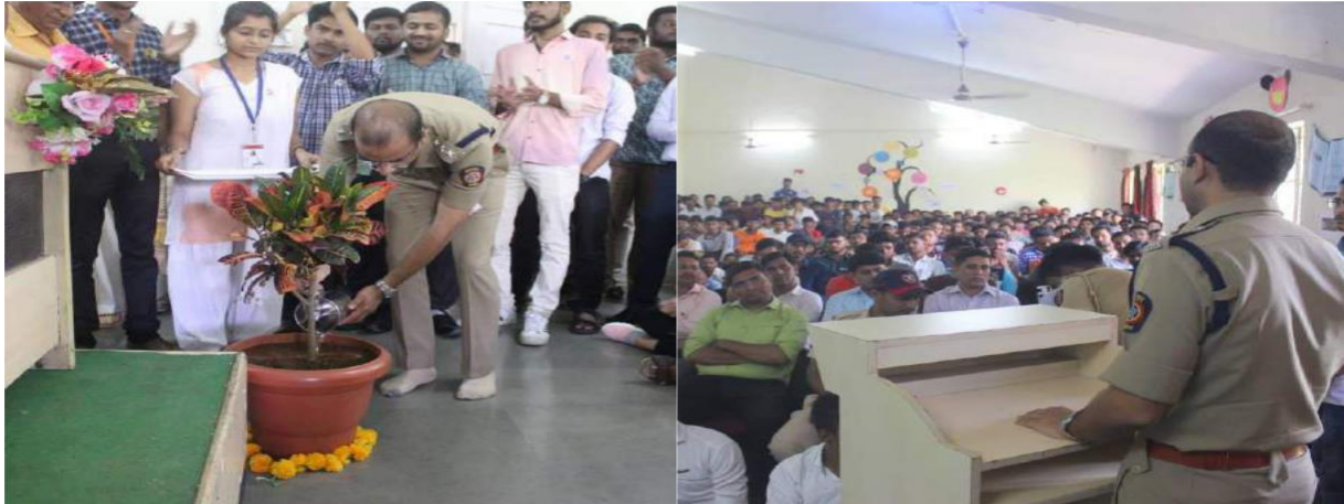
Watering the Tree & Guidance to Students by Guest