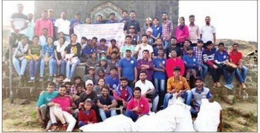
लोहगड : गडावरील स्वच्छता मोहिमेत सहभागी झालेले स्वयंसेवक व प्राध्यापक.

शिबिरादरम्यान ग्रामफेरी व ग्राम सर्वेक्षण करण्यात आले. शिबिर काळात स्वयंसेवकांनी स्वच्छता अभियान, आरोग्य तपासणी शिबिर, जलयुक्त शिवार योजना, ऊर्जा साक्षरता व संवर्धन, पर्यावरण जनजागृती ऐतिहासिक वसा व वारसा संवर्धन शासकीय योजना व त्याचा लाभ, माती व पाणी परीक्षण, रांगोळी स्पर्धा, खाद्य-संस्कृती, विविध शालेय स्पर्धा, राबविण्यात आल्या. या