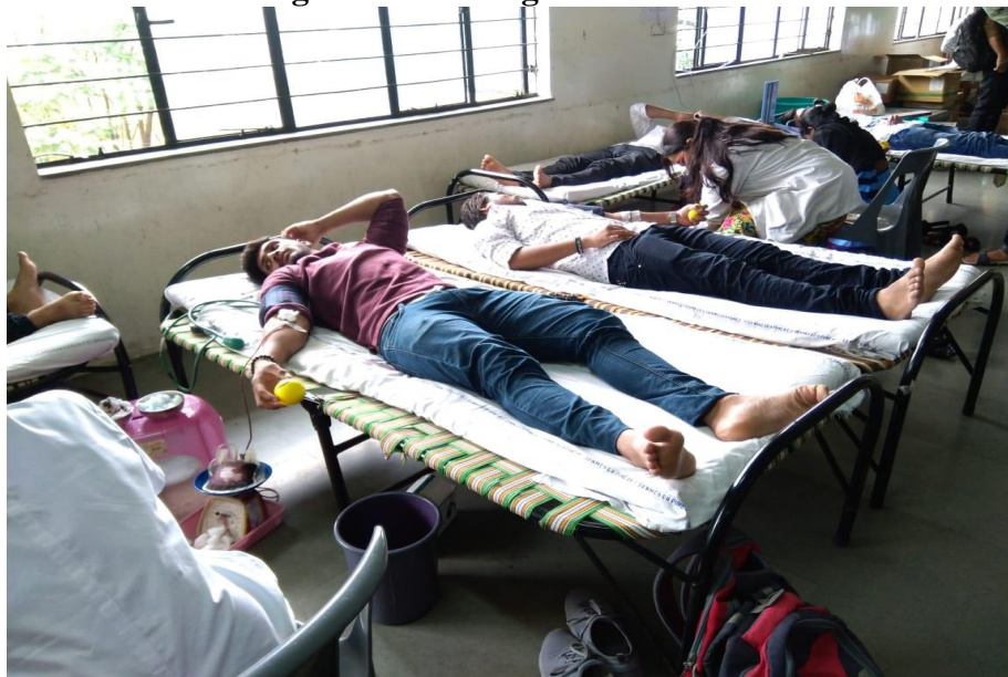
Blood Donation by Students