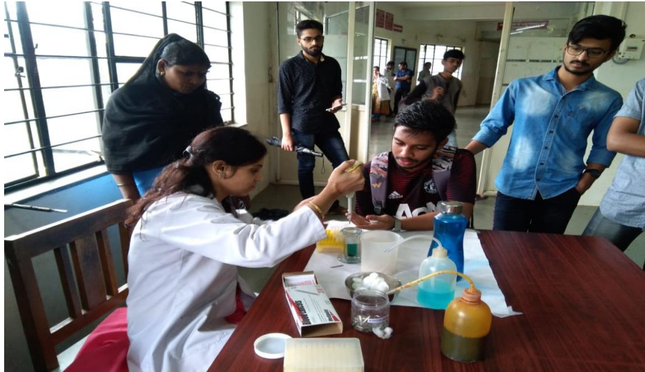
Hemoglobin Checking for Blood Donation