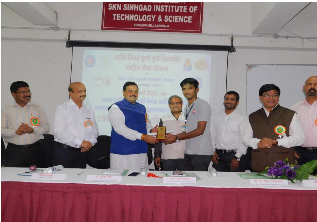
Prize Distribution to NSS Volunteers