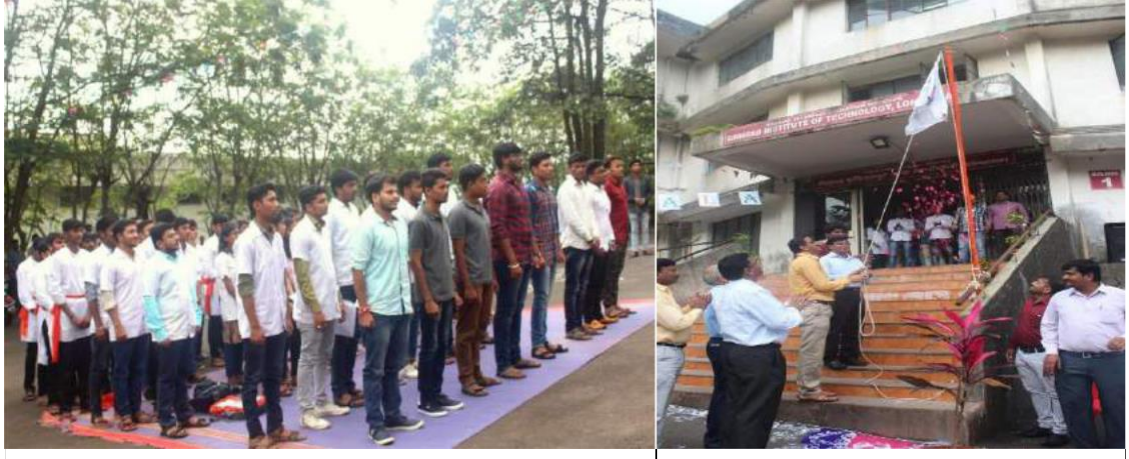
Celebration of NSS day

Sinhgad Institutes Gat No. 309/310, off Mumbai Pune Expressway Kurgaon (Bk), Lonavala Pune -410401 website: sit.sinhgad.edu