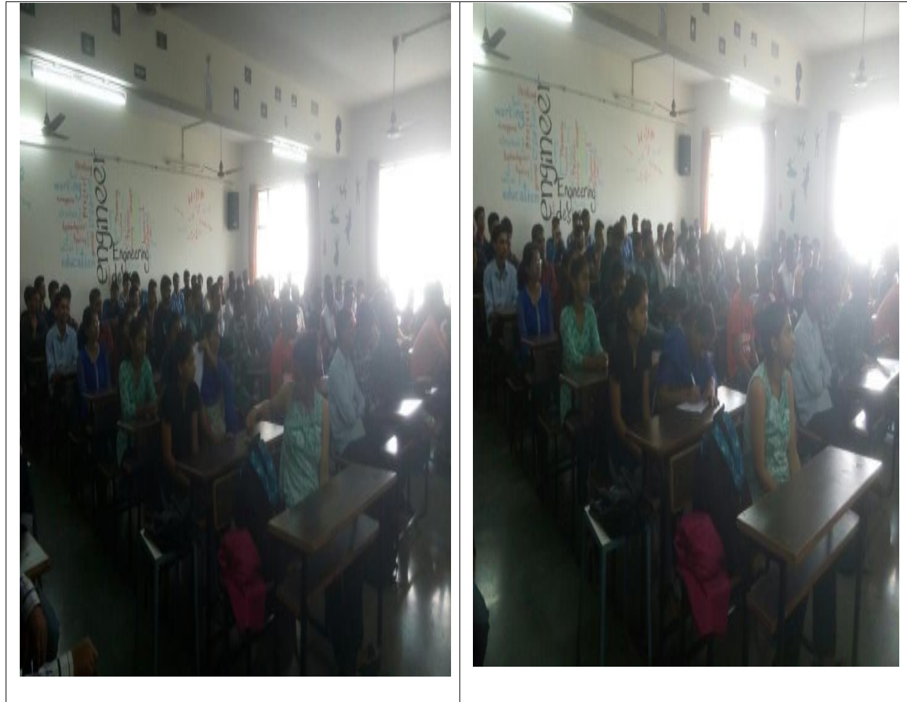
Students of SE and TE Present for Seminar