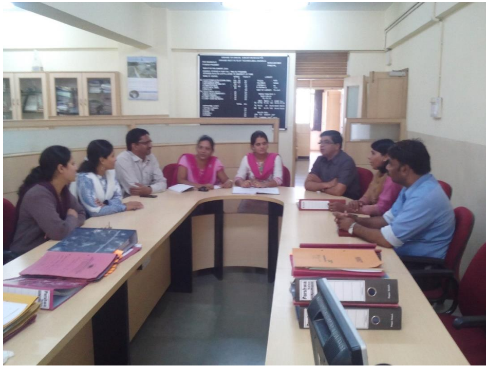
2. Snap of Women's Grievance Committee Members