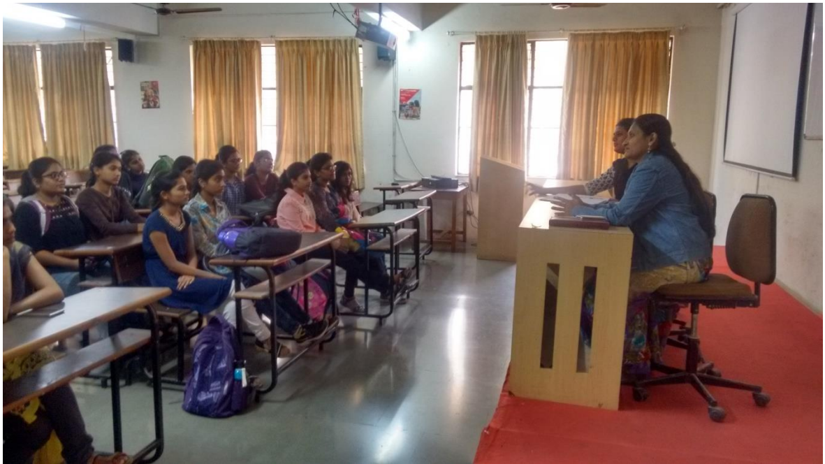
3.. Women's Grievance Committee Members Meeting with Girl Students