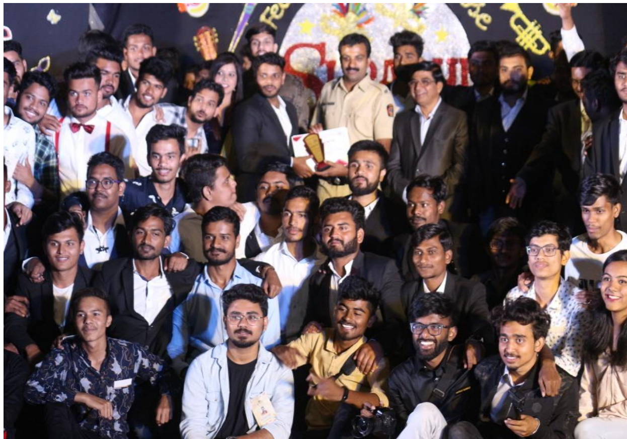
Prize Distribution in Cltural Event.

(Affiliated to Savitribai Phule Pune University, Pune & Approved by AICTE) Gat No. 309/310, off Mumbai Pune Expressway Kusgaon (Bk), Lonavala Pune -410401 website: sit.sinhgad.edu