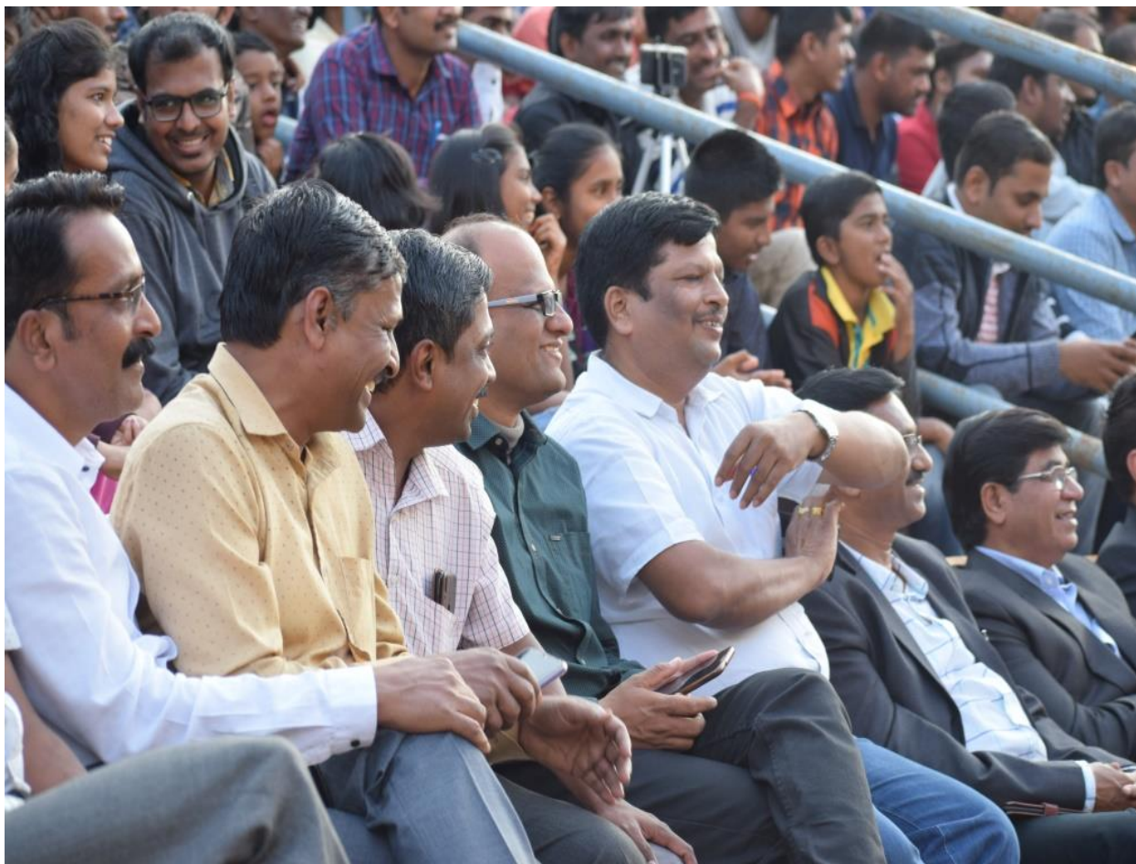
Principal, HOD and Faculty members of SIT in Cultural Event.

Surabhi is an annual gathering event organized by Sinhgad Institute of Technology. Surabhi offers a platform to the students to show their skills other than academics. Every year Surabhi was organized in the second semester Jan or Feb month. Various events were organized like Solo Singing, Duet Singing, Solo Dance, Duet Dance, Group Dance, Fashion Show, Mr. and Miss SIT, Stage Play, Ages of Rock, etc. Students from various departments are participating in this event and get chance to explore their extra-curricular skills apart from their academics. Various judges from different fields were invited to judge the students' performance and select the best among them. Event is aimed at overall development of the students.