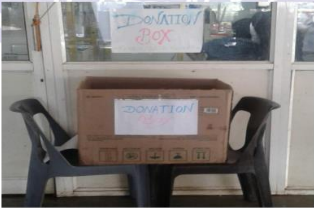
Kerala Flood Donation Drive