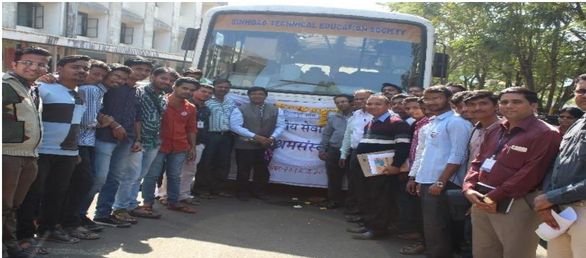
Lokiaagar N.S.S. Camp