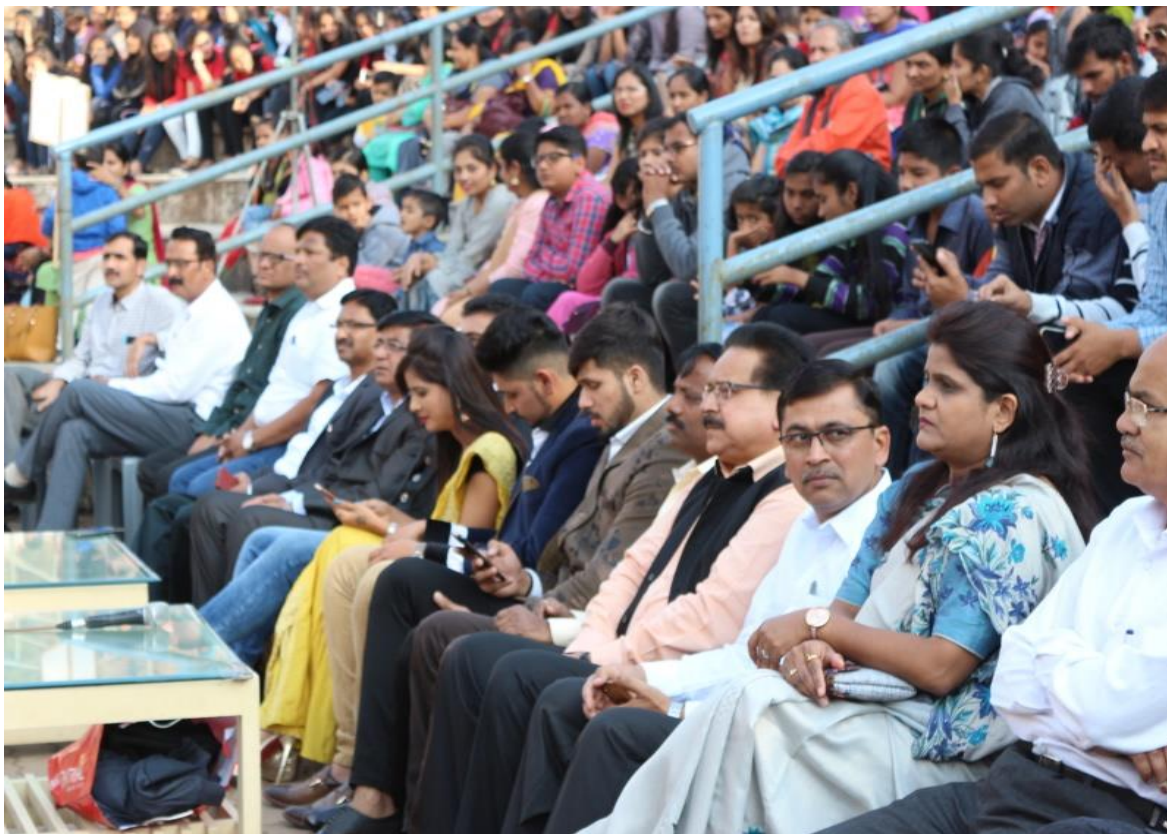
Chief Guest of Cultural Event

(Affiliated to Savitribai Phule Pune University, Pune & Approved by AICTE) Gat No. 309/310, off Mumbai Pune Expressway Kusgaon (Bk), Lonavala Pune -410401 website: sit.sinhgad.edu