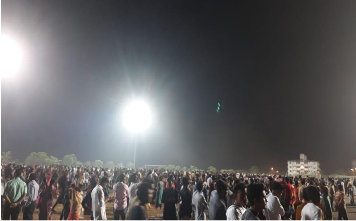
Dandiya Celebration on cricket ground.

(Affiliated to Savitribai Phule Pune University, Pune & Approved by AICTE) Gat No. 309/310, off Mumbai Pune Expressway Kusgaon (Bk), Lonavala Pune -410401 website: sit.sinhgad.edu