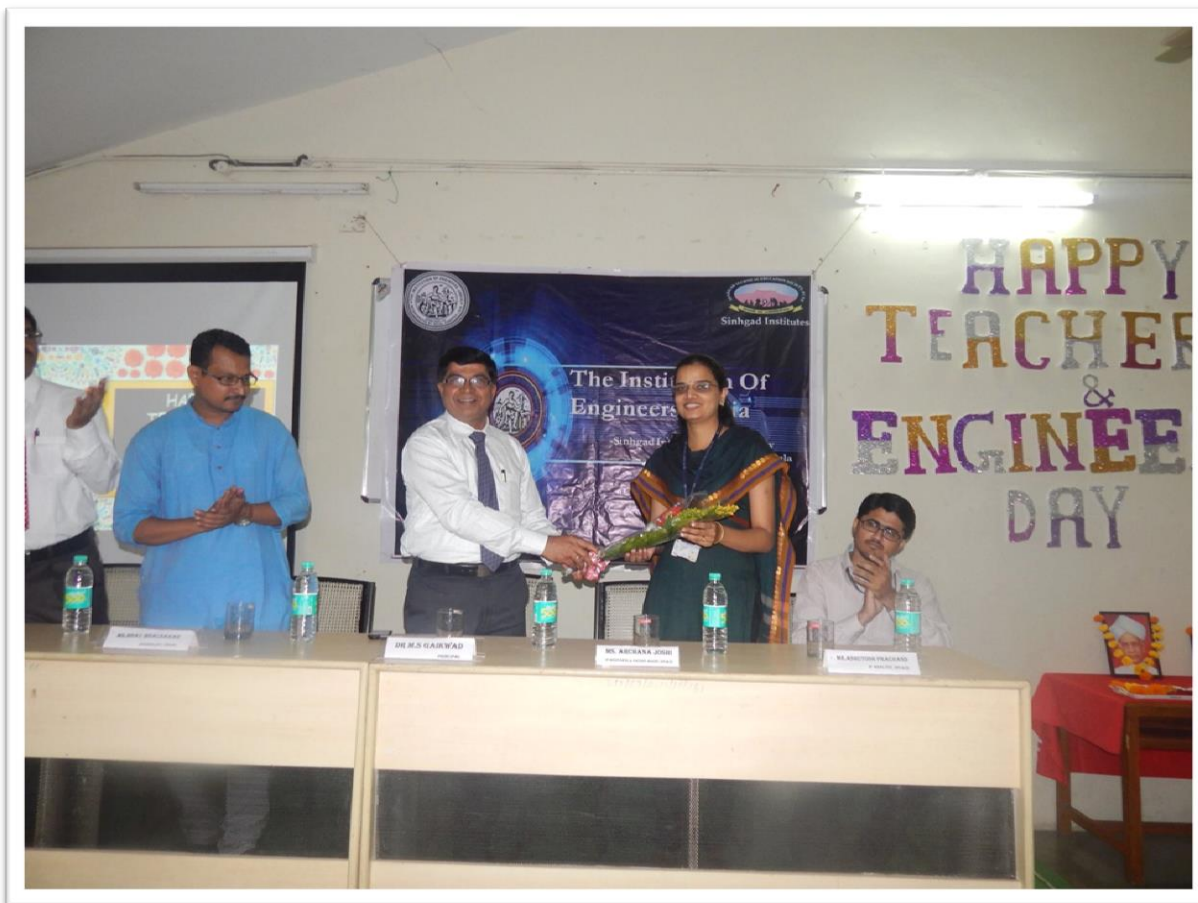
Teachers Day, Engineer's Day