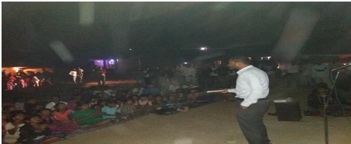
Addressing students in lokjagar camp