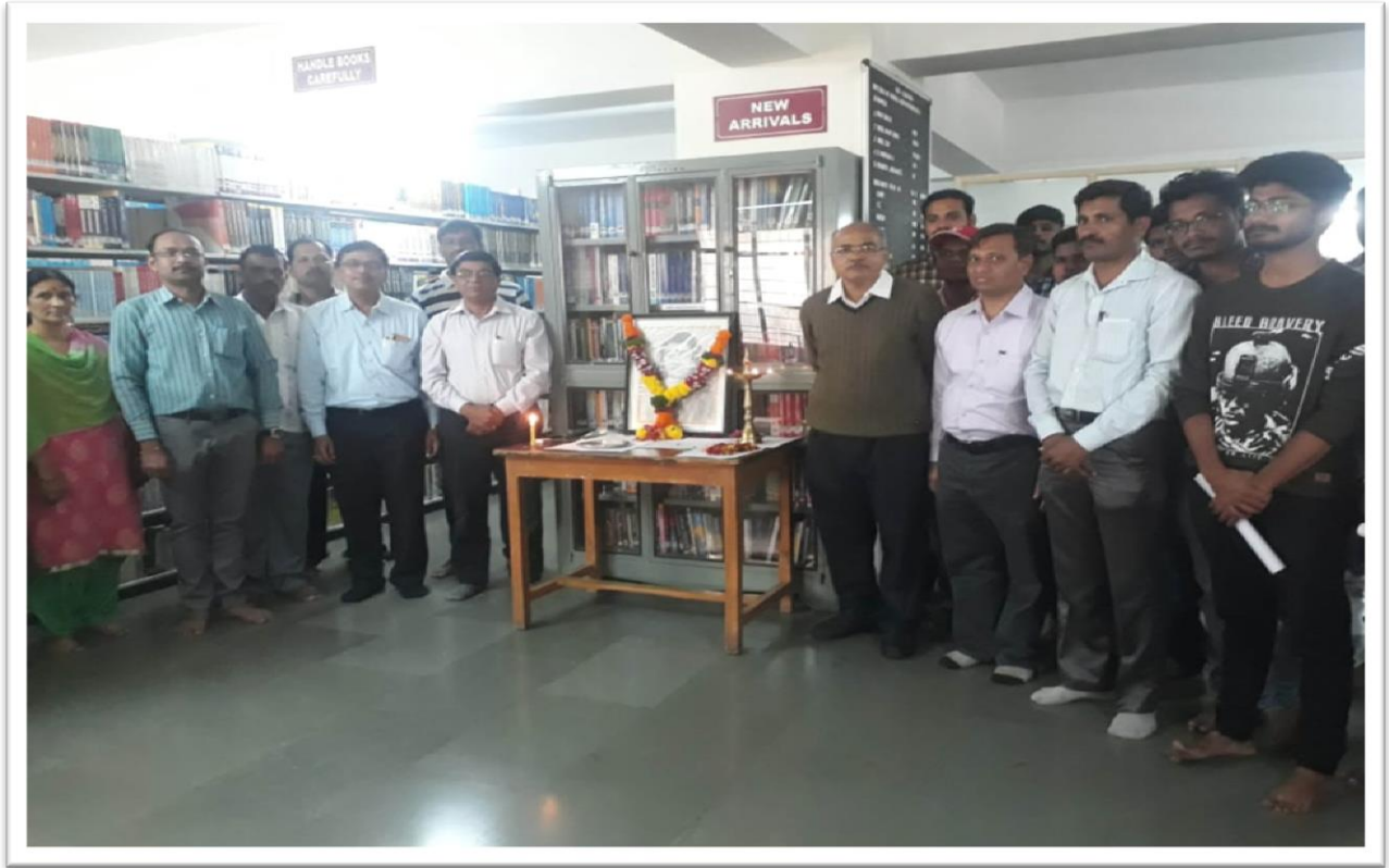
Reading Day: Birth anniversary of Dr. A.P.J Abdul Kalam

(Affiliated to Savitribai Phule Pune University, Pune & Approved by AICTE) Gat No. 309/310, off Mumbai Pune Expressway Kusgaon (Bk), Lonavala Pune -410401 website: sit.sinhgad.edu