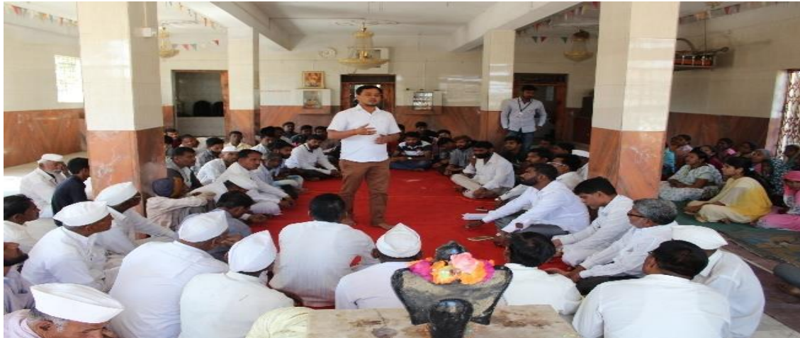
Faculty member interacting with villagers

(Affiliated to Savitribai Phule Pune University, Pune & Approved by AICTE) Gat No. 309/310, off Mumbai Pune Expressway Kurgaon (Bk), Lonavala Pune -410401 website: sit.sinhgad.edu