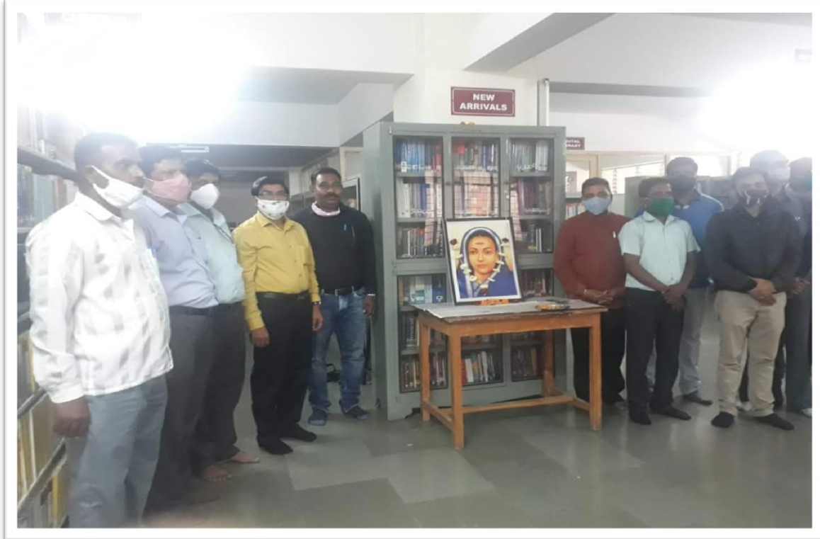
Savitribai Phule Birth Anniversary Celebration