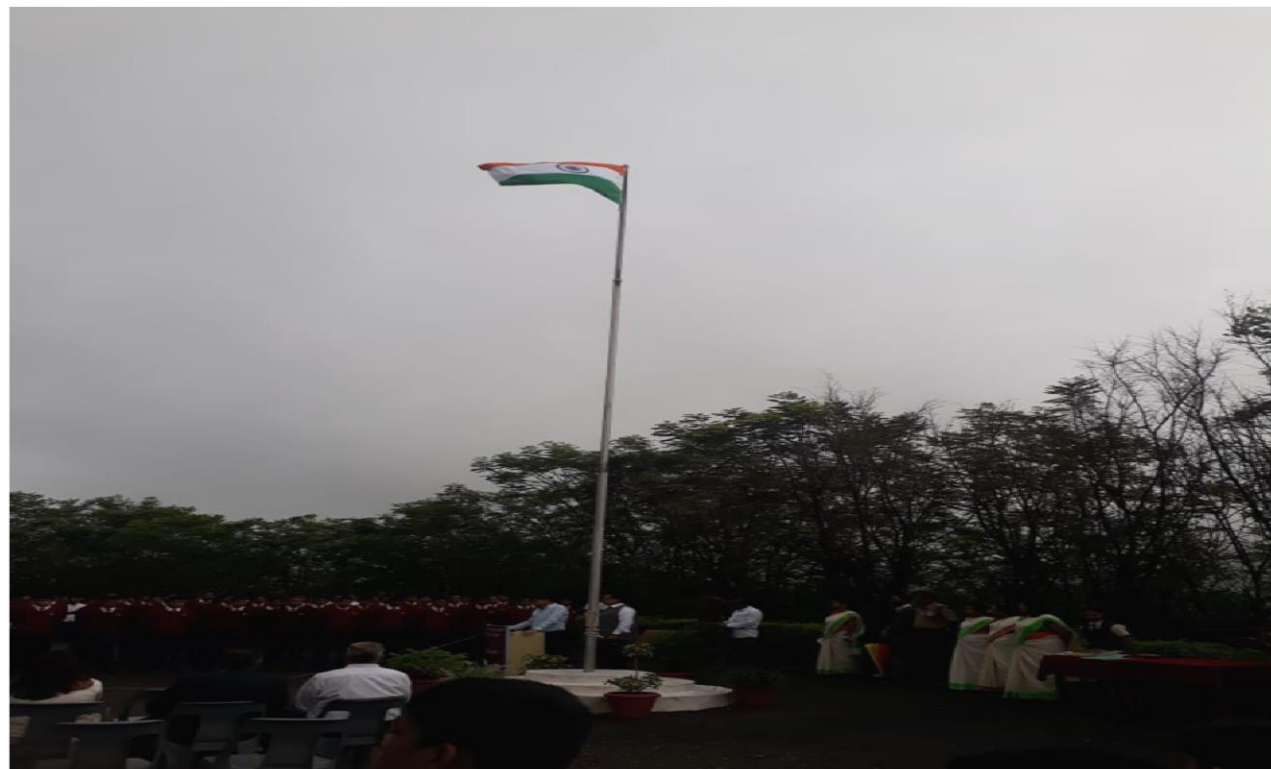
Celebration of National Festivals: Independence Day

(Affiliated to Savitribai Phule Pune University, Pune & Approved by AICTE) Gat No. 309/310, off Mumbai Pune Expressway Kusgaon (Bk), Lonavala Pune -410401 website: sit.sinhgad.edu