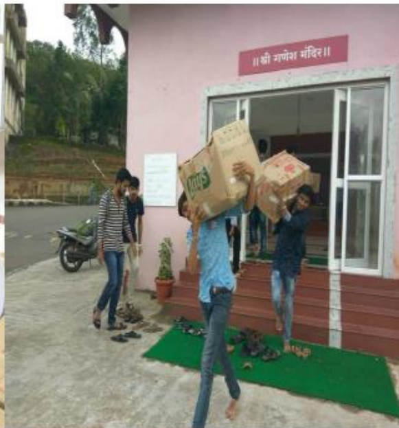
Kerala Flood Donation Drive