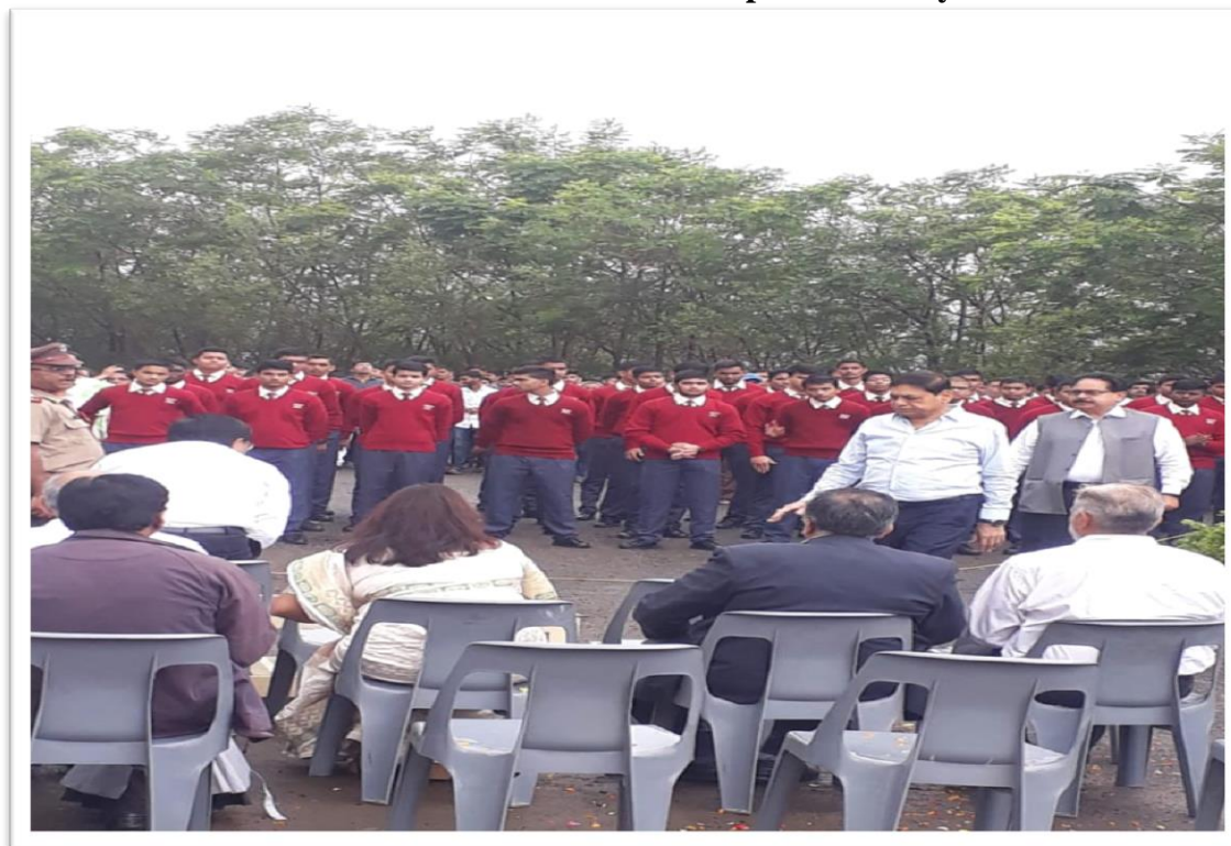
Celebration of National Festivals: Republic Day