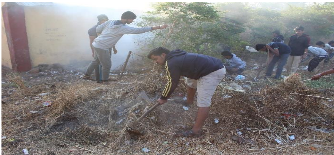
Cleanliness awareness camp by SIT student.