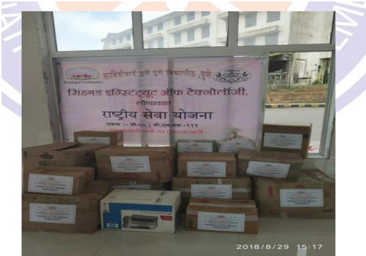
Kerala Flood Donation Drive

(Affiliated to Savitribai Phule Pune University, Pune & Approved by AICTE) Gat No. 309/310, off Mumbai Pune Expressway Kurgaon (Bk), Lonavala Pune -410401 website: sit.sinhgad.edu