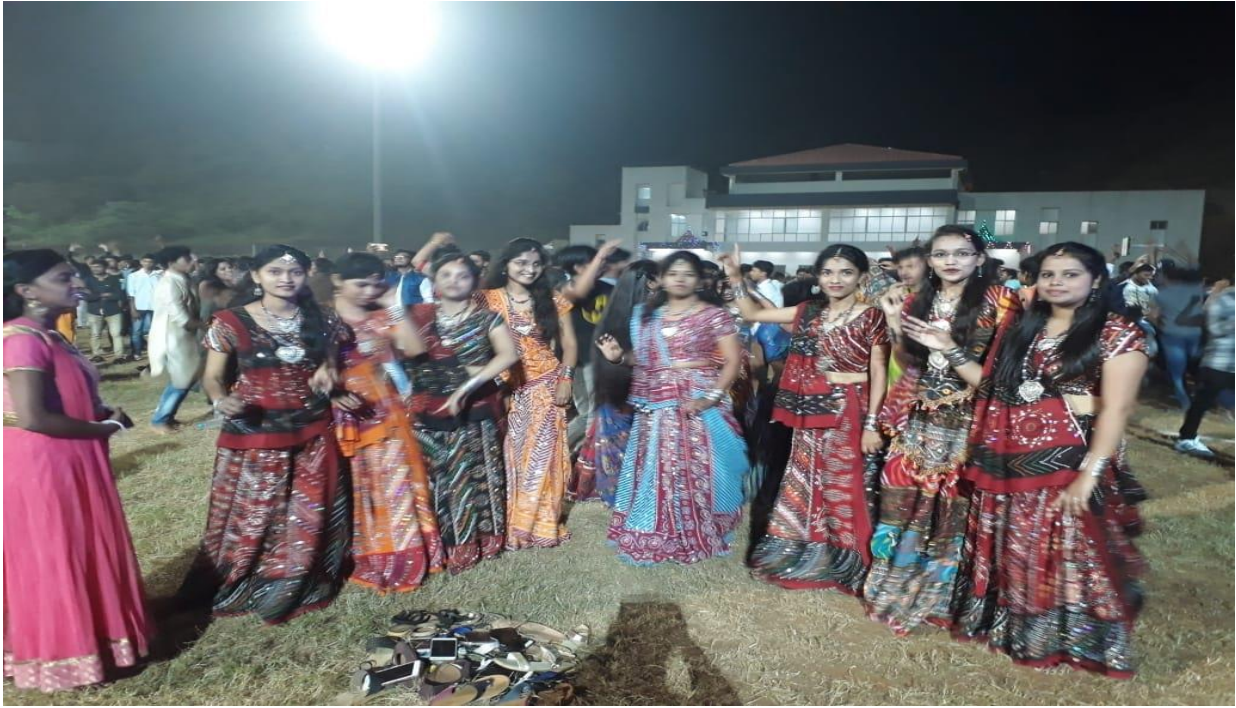
Students of Different region celebrate dandiya

(Affiliated to Savitribai Phule Pune University, Pune & Approved by AICTE) Gat No. 309/310, off Mumbai Pune Expressway Kusgaon (Bk), Lonavala Pune -410401 website: sit.sinhgad.edu