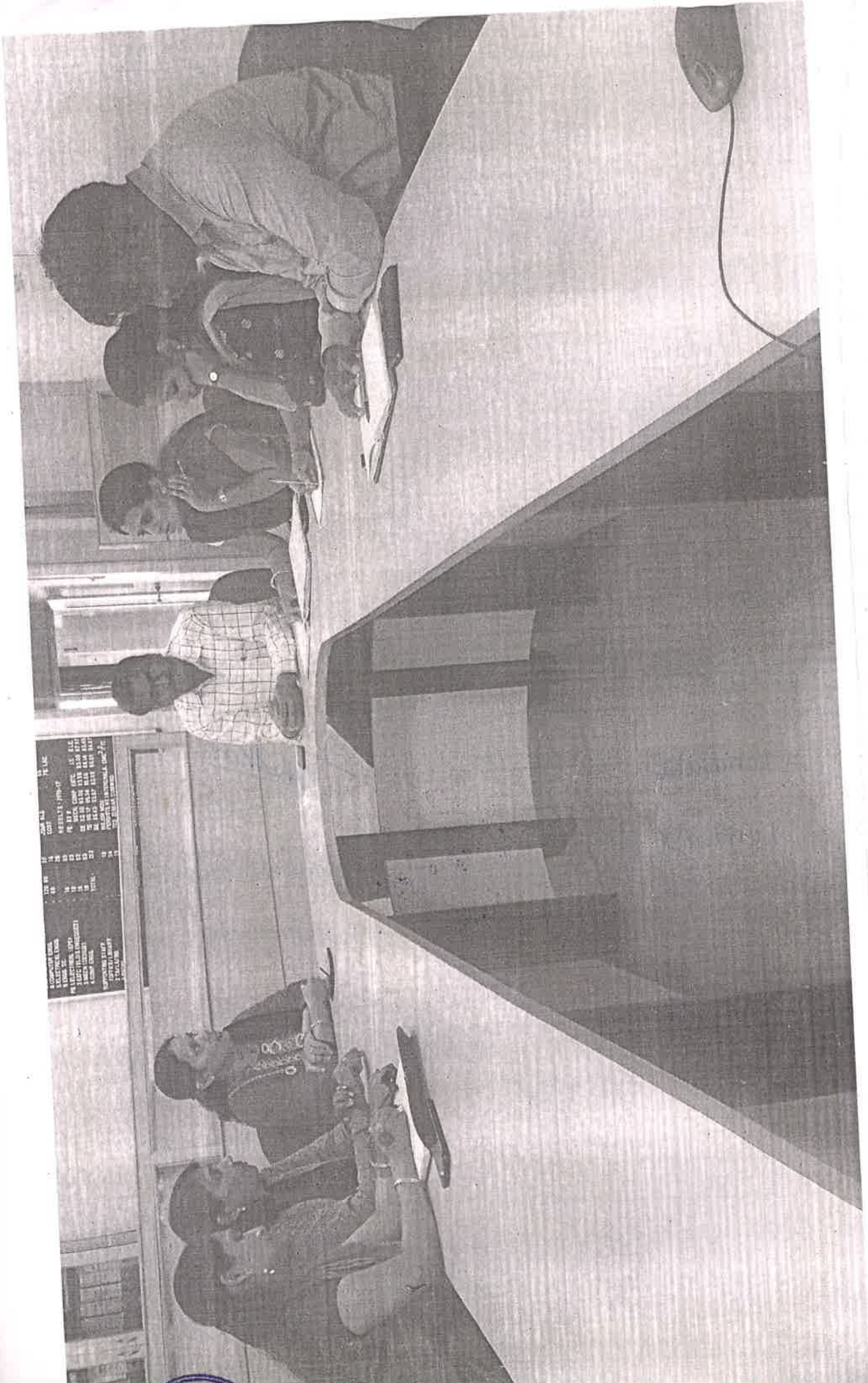
- Committee members Attending meeting -