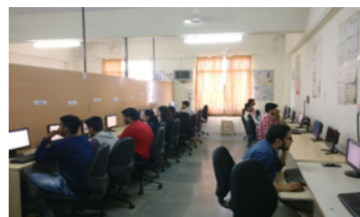
DEBUG THE BUG