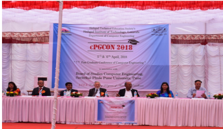
Inaugural function of cPGCON2018

The 7th cPGCON 2018, which is an annual conference for the Computer Engineering Post graduate students, was held at Department of Computer Engineering, Sinhgad Institute of Technology, Lonavala on 5th and 6th April 2018 . The event was organized in association with BOS Computer Engineering and Savitribai Phule Pune University, Pune.